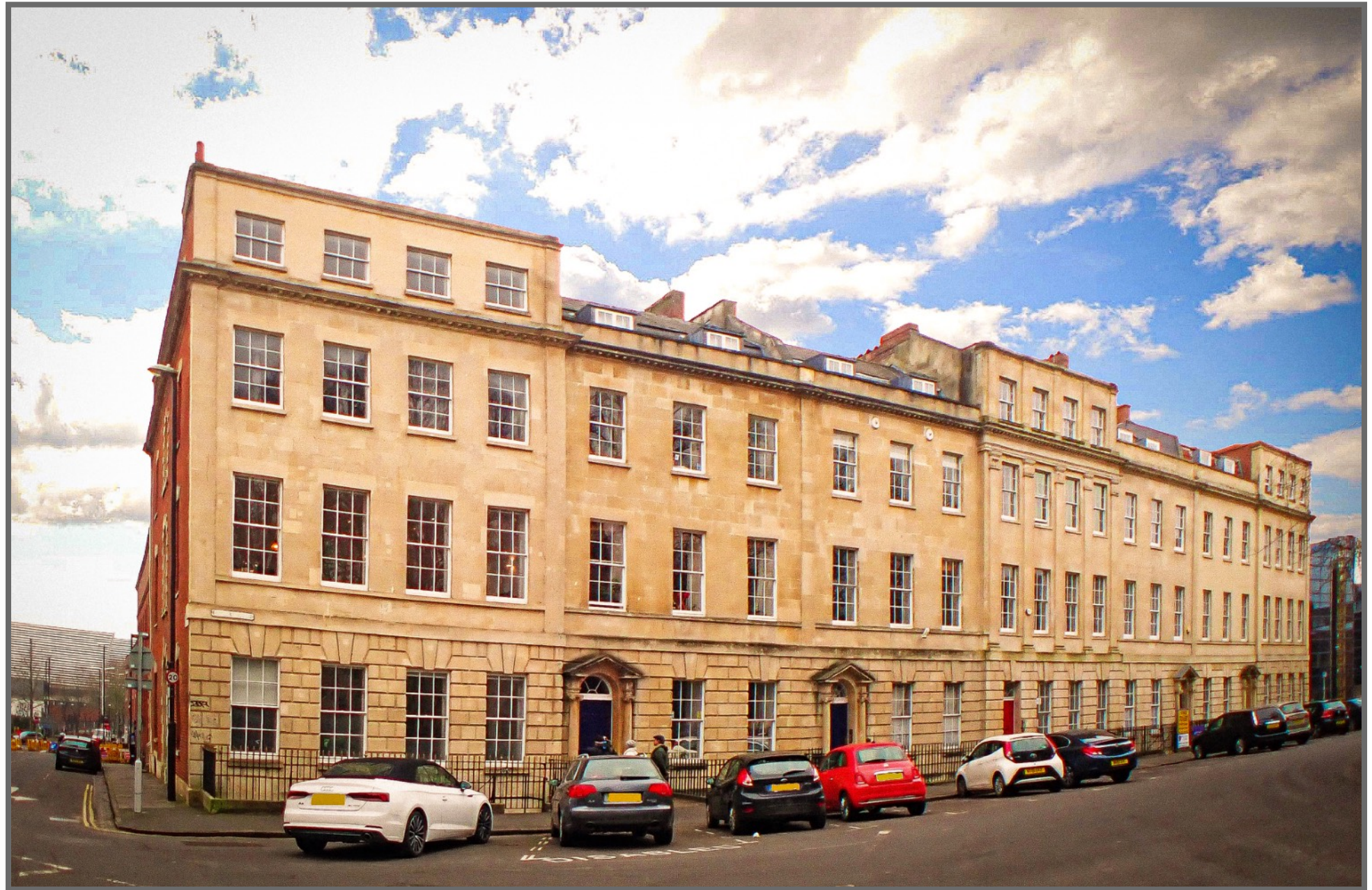
FLAT 7, 11 PORTLAND MANSIONS, PORTLAND SQ, BRISTOL, BS2 8SR